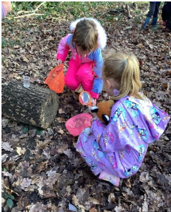
Year 1’s first Forest School sessions