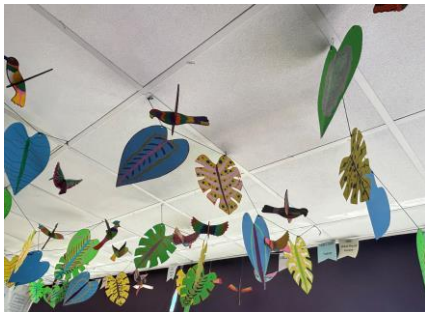
Year 4 Delight in Art