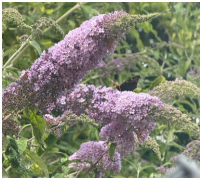
Nursery’s Caterpillar that evolved into a beautiful butterfly